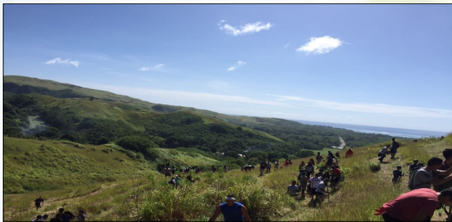
GEO was one of many partners at the DoAg tree planting event.