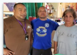
PERSONS WITH DISABILITIES