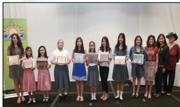
Poster & Essay Contest