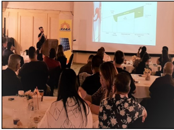
Energy Outreach Session