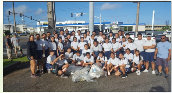
GEO staff/JFK ROTC—Islandwide cleanup