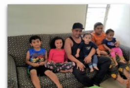
FAMILIES WITH CHILDREN